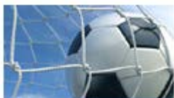
WORLD CUP SOCCER