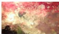
THE ART OF BACTERIA