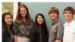
THE SUMMER FELLOWS