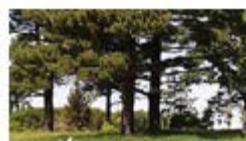
UNFORTUNATE TREE LOSS