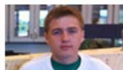
GOLF BALLS & WIND TUNNELS