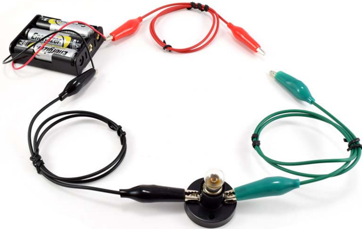
Figure 4. The test circuit for this experiment. The twist ties are not required, but they can help keep your circuit neat by bundling up the alligator clip leads.

3. Make a data table like Table 1 in your lab notebook.