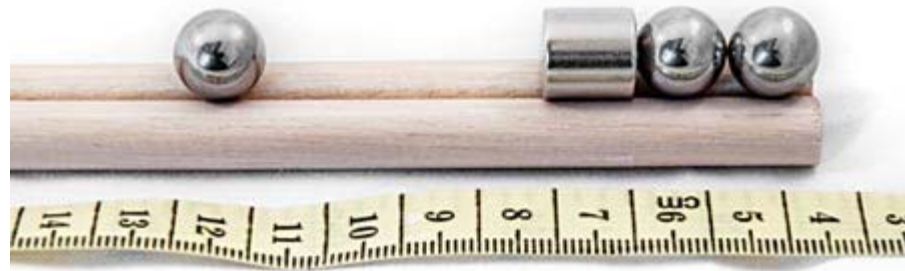
Figure 2. A one-stage Gauss rifle. Note the two ball bearings touching the magnet stage at the end of the slide (as described in step 4) and the single ball bearing (the starter ball) 5 cm behind the magnet stage (as described in step 6).