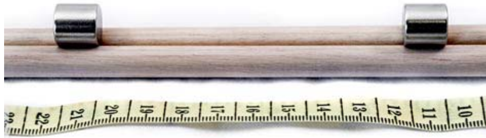
Figure 4. The magnet stages are spaced 10 cm apart, as measured from the front of the first magnet stage (at right) and the front of the second magnet stage (at left).