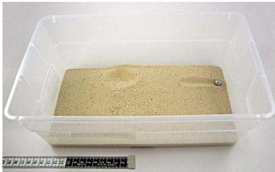
Figure 3. In this case, the launched ball bearing landed in the crater at left, then bounced and slid to where it finally stopped at the right side of the box. The tape measure is positioned to start measuring from the circular crater at left—the place where the ball bearing first hit the sand.