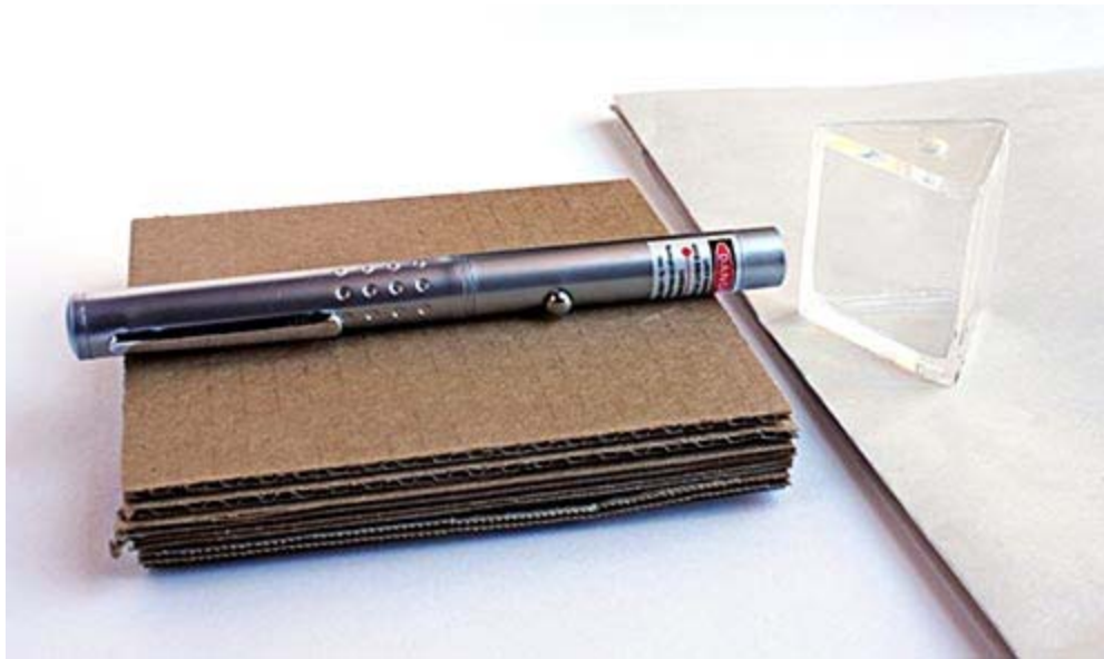
Figure 8. Adjust the height of the laser pointer with pieces of cardboard. The beam of the laser should hit the prism about halfway up the prism's side.