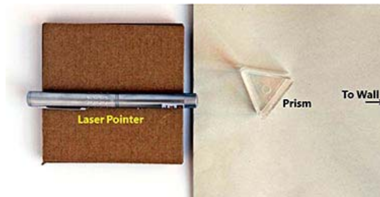
Figure 7. Photograph showing experimental setup for measuring the index of refraction of a liquid. The prism is a few centimeters in front of the laser pointer. The laser pointer is pointing perpendicular to a nearby wall.