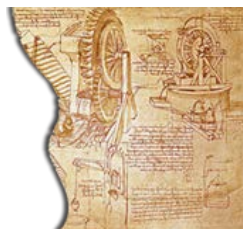
(Leonardo DaVinci kept numerous design notebooks.)